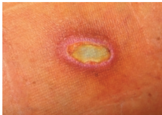
FIGURE 8C. VIOLIN SPIDER BITE HEALING.