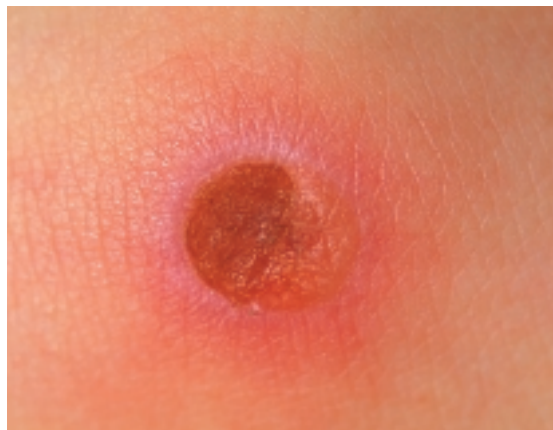
FIGURE 6. SAC SPIDER ( CHEIRACANTHIUM ) BITE.