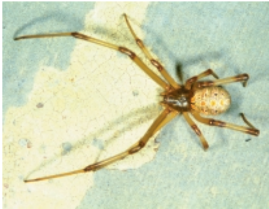
FIGURE 3. BROWN BUTTON SPIDER ( LATRODECTUS GEOMETRICUS ) – DORSAL VIEW.