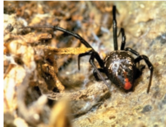
FIGURE 1. BLACK BUTTON SPIDER ( LATRODECTUS INDISTINCTUS ).

The female L. indistinctus group body length is 7–15,6 mm (excluding legs). Her abdomen is spherical, and black or dark brown. The dorsal side of the abdomen is decorated with clear red stripes that reduce with each moult until only a red dot is visible above the spinnerets. This red