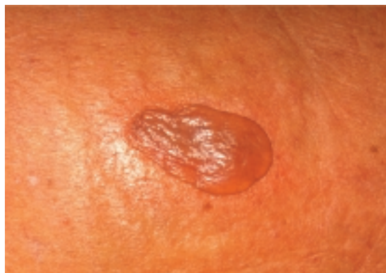
FIGURE 8A. VIOLIN SPIDER BITE AT 72 HOURS.