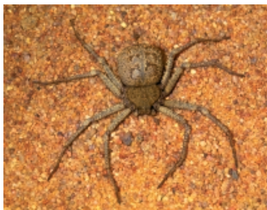
FIGURE 9. SIX-EYED SAND SPIDER ( SICARIUS ).