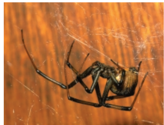
FIGURE 2. BROWN BUTTON SPIDER ( LATRODECTUS GEOMETRICUS ).

dot may even be absent in adult spiders (Figure 1). The legs are long and thin, with the third pair characteristically shorter than the rest. She spins an irregular web between grass or stones. The male spider is small, with abdomen only 2,6–4,85 mm long.