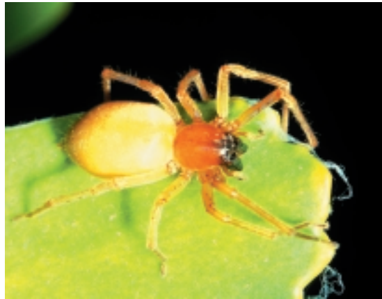
FIGURE 5. SAC SPIDER ( CHEIRACANTHIUM FURCULATUM ).