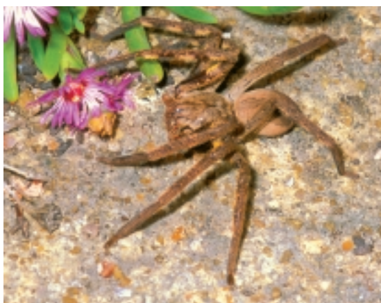
FIGURE 10. RAIN SPIDER ( PALYSTES SUPERCILIOSUS ).