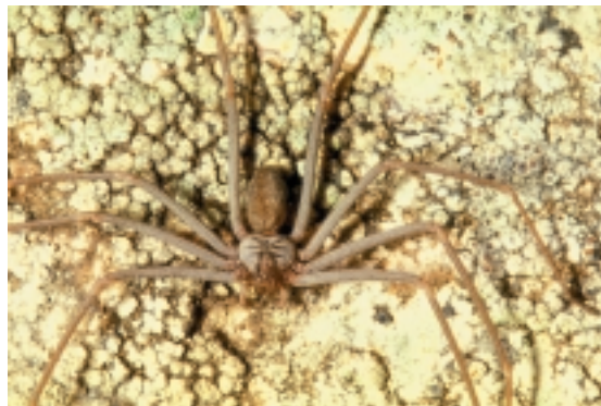
FIGURE 7. VIOLIN SPIDER ( LOXOSCELES ).