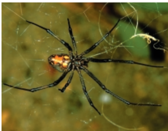
FIGURE 4. BROWN BUTTON SPIDER ( LATRODECTUS GEOMETRICUS ) – VENTRAL ABDOMEN.

displays a characteristic orange-red hour-glass marking (Figure 4). This spider is widely distributed in South Africa, occurring mainly in urban environments; specifically around homes. The web is found under window sills, drain pipes, garden furniture, post boxes and outside toilets. 6,7