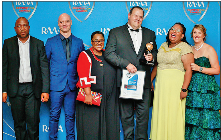
Prevention Champion Award