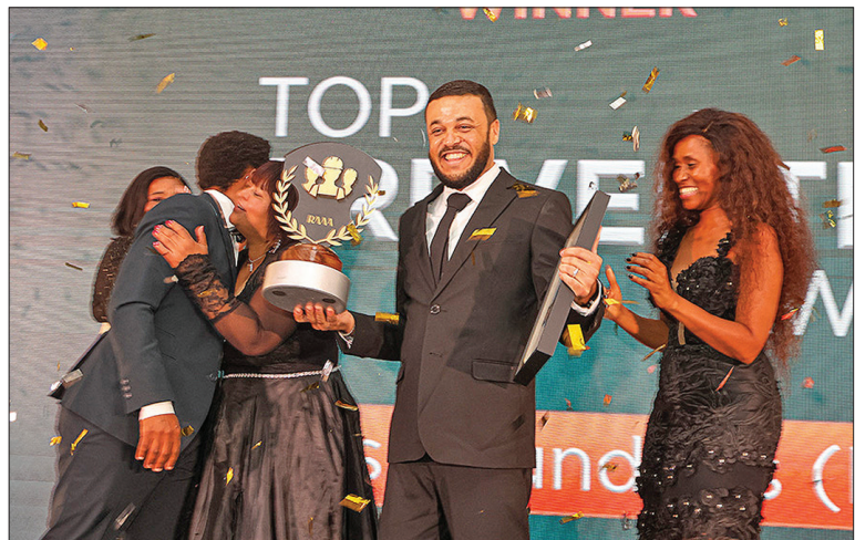
Top Prevention Award